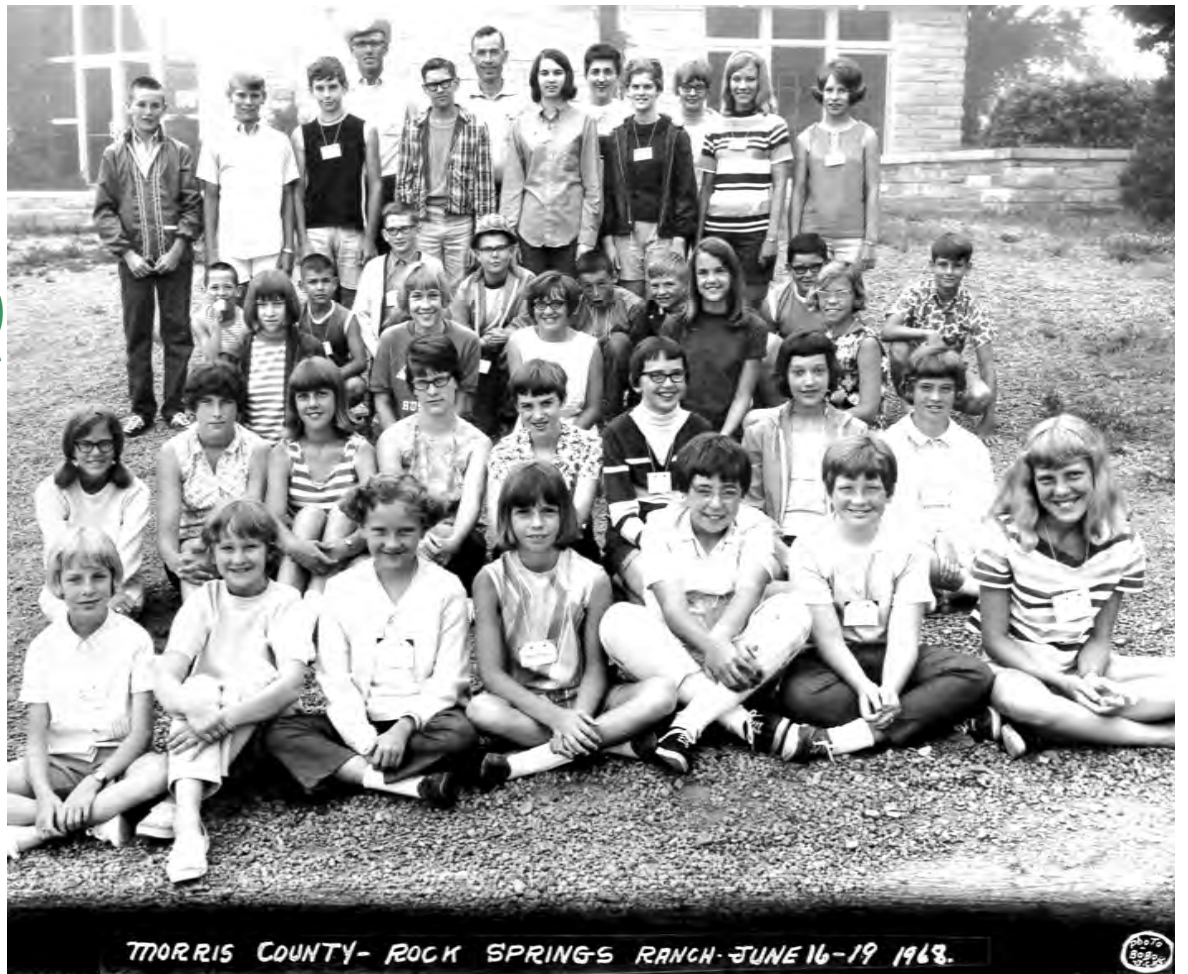
MORRIS COUNTY- ROCK SPRINGS RANCH- JUNE 16-19 1963.