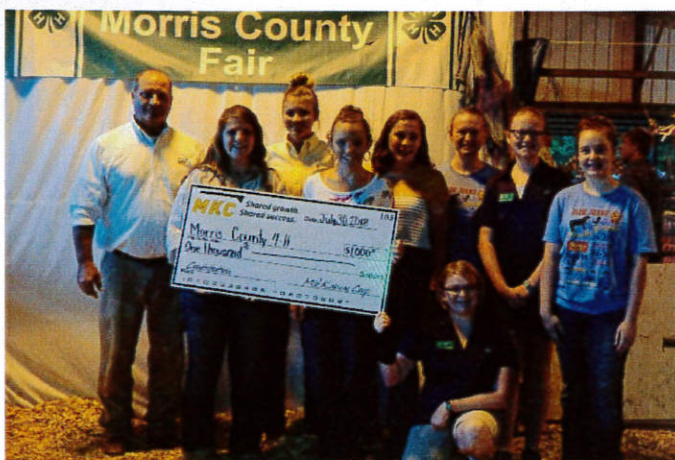
MKC contributed $1000 to the Morris County 4-H Council at the Fair. The generous donation was accepted by the Ambassadors.