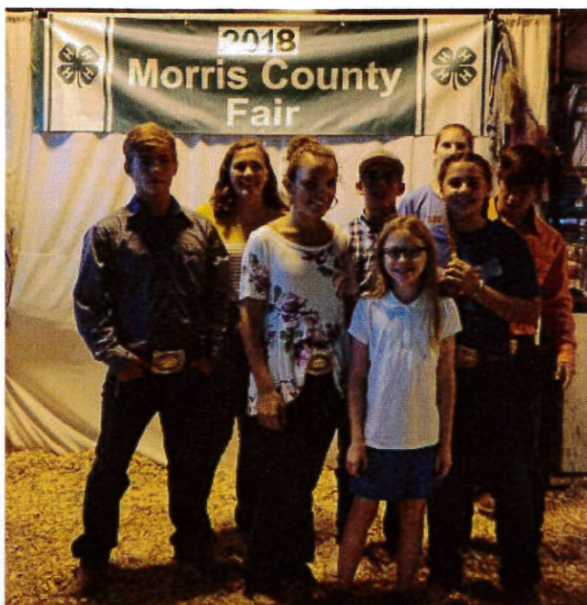
Herdsmanship goes to the Flint Hills 4-H Club