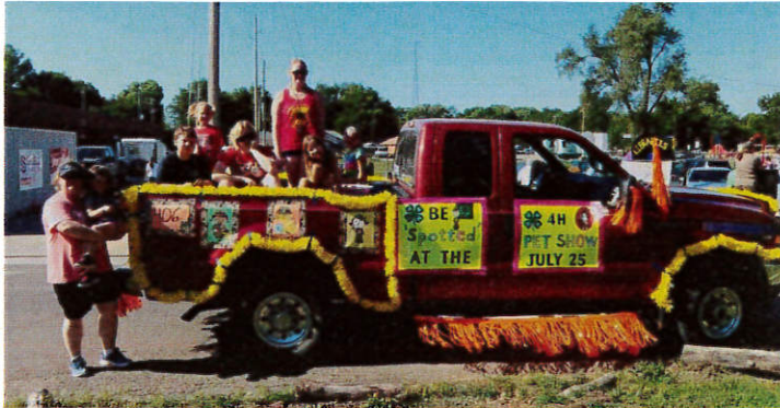
Neosho Valley 4-H Club