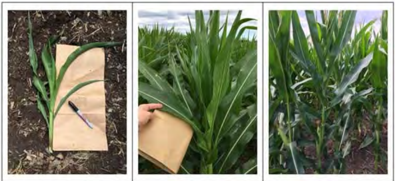
Figure 1. Corn sampling during different growth stages.