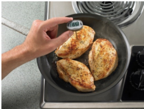
A food thermometer is a great investment for safe food!

When cooking any meat, poultry, and egg products, a food thermometer is the best tool in your kitchen to determine if the food is done and safe for consumption.