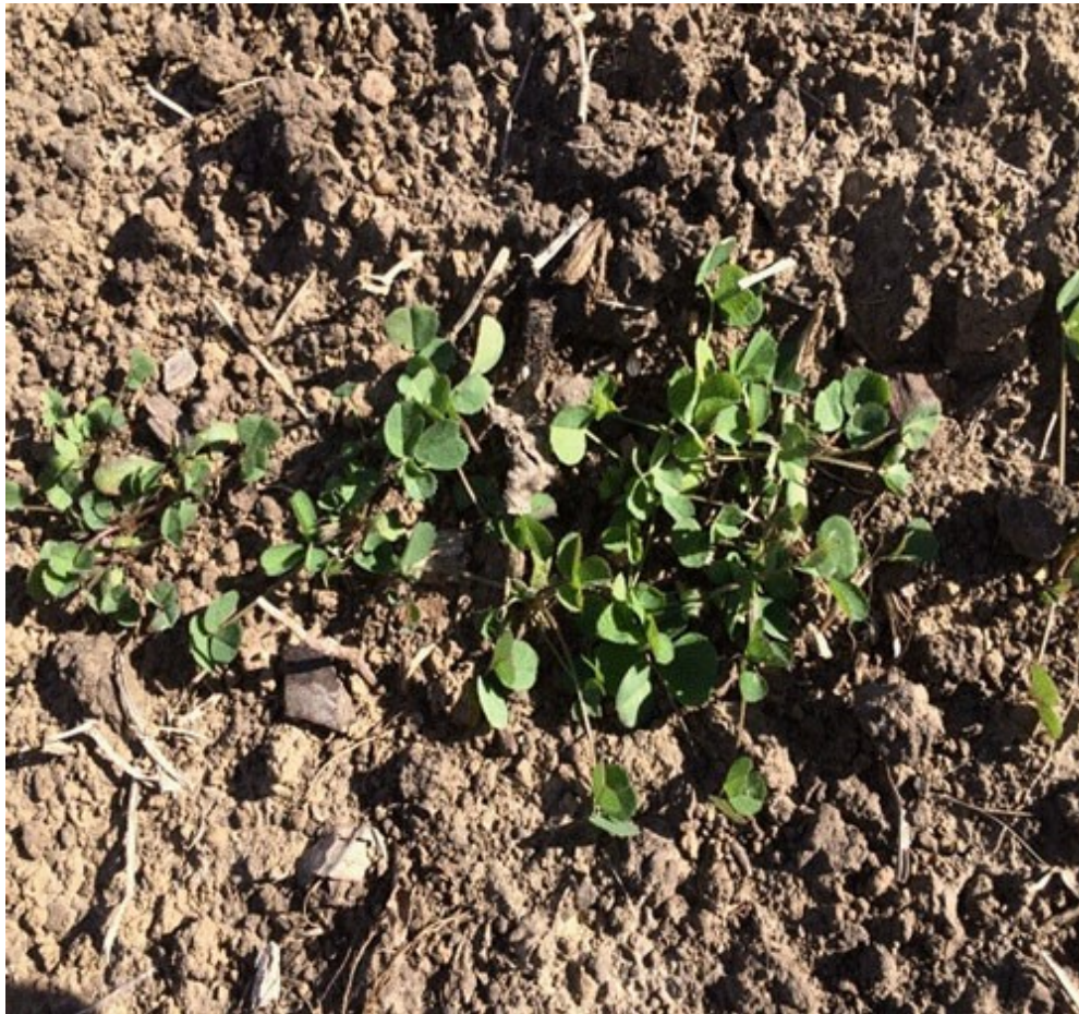
Figure 1. Alfalfa seedlings.

In 2021, over 700,000 acres of alfalfa were harvested in Kansas. Alfalfa is a very important leguminous crop for dairy and livestock industry in the state. Alfalfa hayfields help to supply forage that is highly digestible and high in protein. Late summer and early fall are often the best times to plant alfalfa in Kansas due to less weed pressure than spring planting.