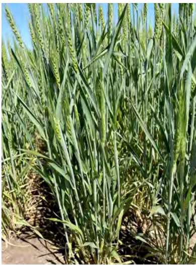
Figure 1. Wheat plants showing later-emerged tillers during the 2022 growing season. Notice the shorter and later heads in the middle to lower portions of the plants. Photo by Luiz Otavio Pradella, K-State Agronomy grad student, near Hays, Kansas.

Rains during the past two weeks have resulted in a flush of late, green tillers in the wheat over much of Kansas (Fig. 1). This can create a problem, especially for wheat that is approaching harvest maturity. A question that usually arises when this happens is: Should I wait to start harvesting until most of the green heads have matured, or just start harvesting anyway?